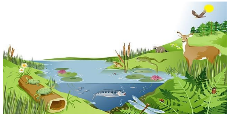
Illustration by Jeff Grader / property of Delta Education

Pet waste is not a good natural fertilizer but it is a great source of bacterial pollution when it gets washed into the storm drains and local waterways.