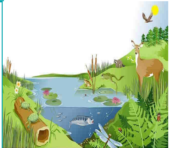
Illustration by Jeff Grader / property of Delta Education

Pet waste is not a good natural fertilizer but it is a great source of bacterial pollution when it gets washed into the storm drains and local waterways.