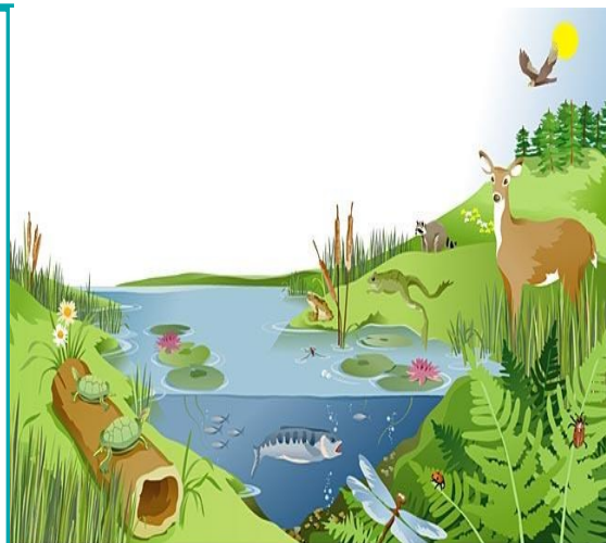
Illustration by Jeff Grader / property of Delta Education

Pet waste is not a good natural fertilizer but it is a great source of bacterial pollution when it gets washed into the storm drains and local waterways.